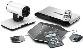
Yealink VC120 Video Conferencing Endpoint