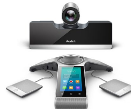
Yealink VC500 Video Conferencing System