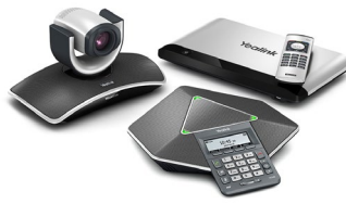
Yealink VC400 Video Conferencing System