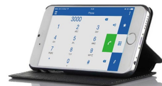
iOS & Android