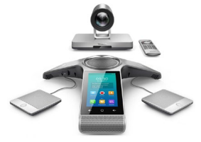
Yealink VC800 Video Conferencing System